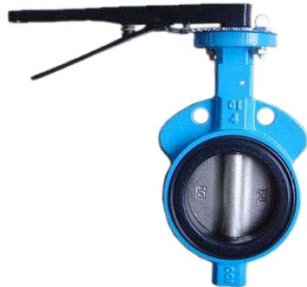
Figure: BW-1000 Series